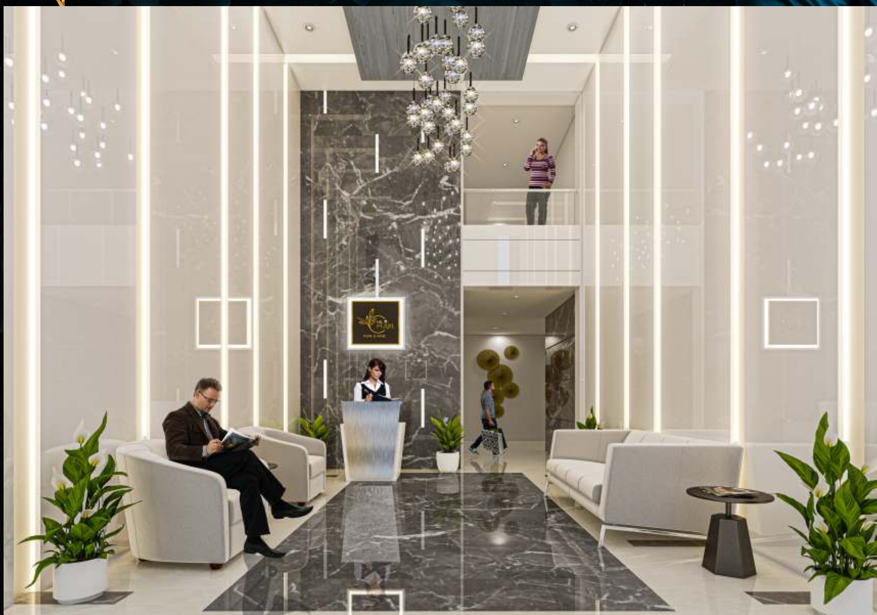
DOUBLE HEIGHT GRAND ENTRANCE LOBBY

YOU HAVE ARRIVED AT A WORLD OF EXCLUSIVITY