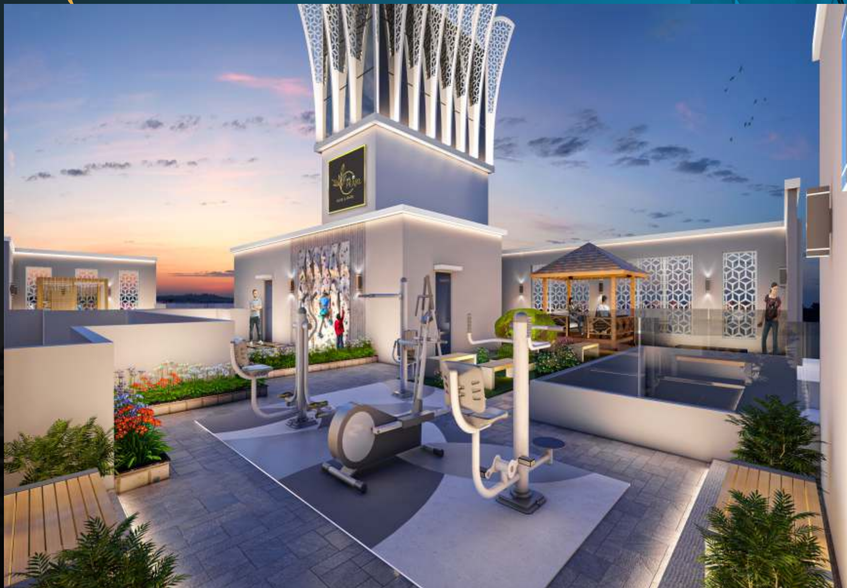
ROCK CLIMBING WALL & OPEN GYM