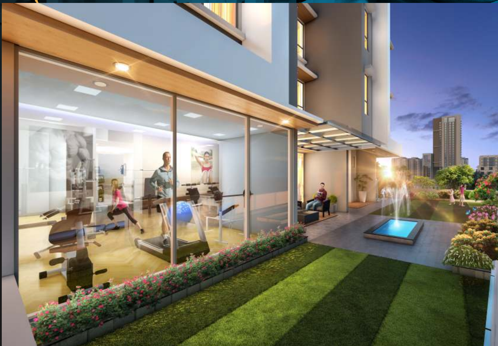
GYM & JOGGING TRACK