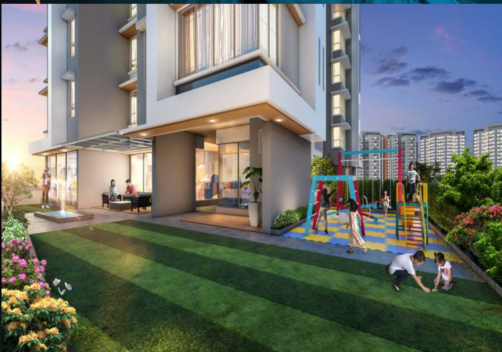
CHILDREN'S PLAY AREA & LAWN