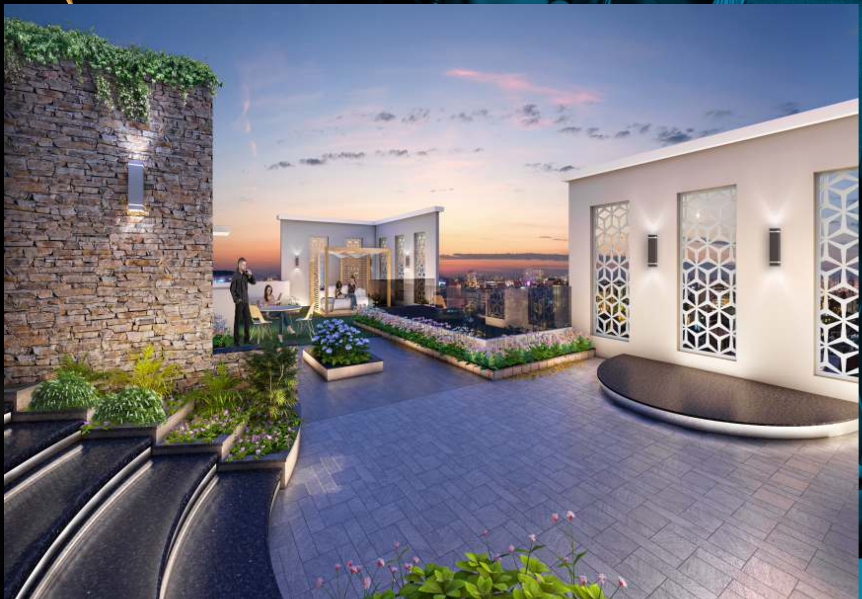
SKY LOUNGE | AMPHITHEATRE